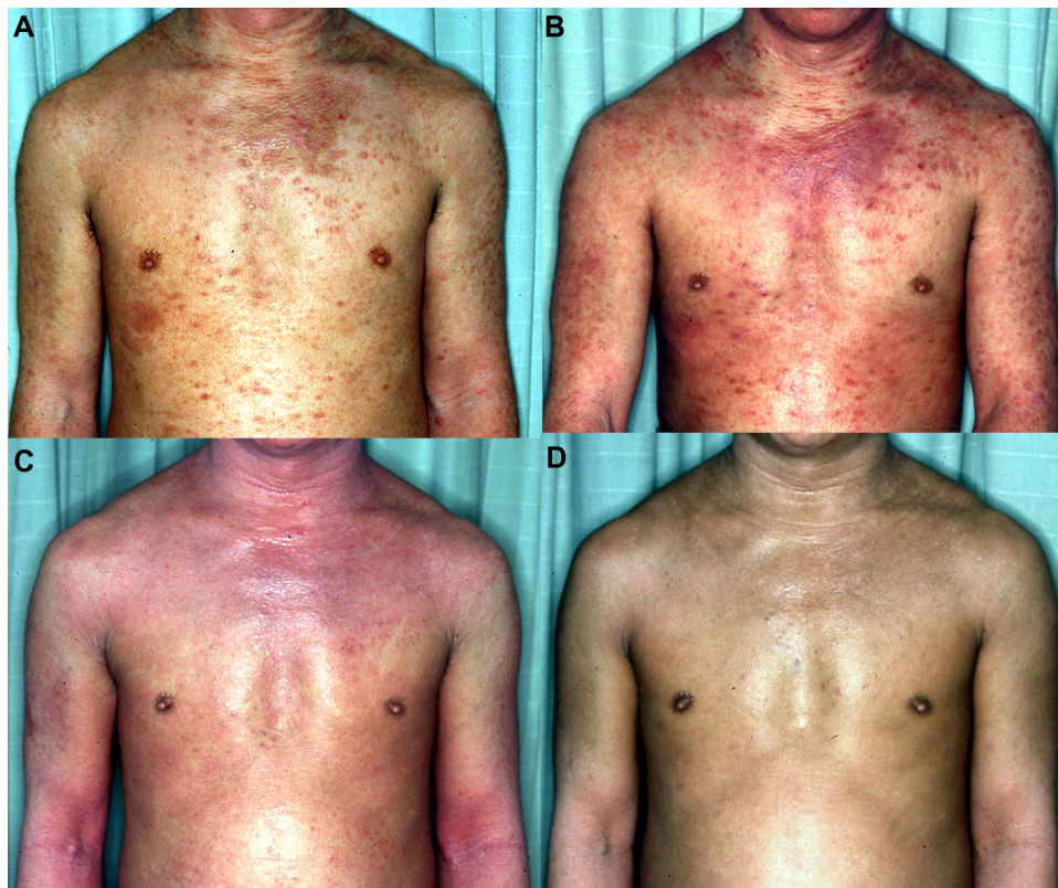
Figure 1 (A) A typical appearance of TSA, with prurigo-like eruption before withdrawal. (B) Appearance just after trial of decreasing the amount of potent topical steroids. The severity of addiction is so intense that the patient cannot safely withdraw by a gradual-decrease method. (C) The rebound erythema is spreading after complete cessation of steroids. (D) The appearance after 1 year. The rebound has almost subsided but hypersensitivity still remains.

Abbreviation: TSA, topical steroid addiction.